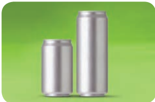
Aluminum food and beverage containers