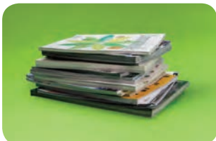
Magazines and catalogues