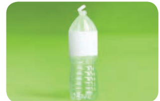
PET #1 plastic food and beverage containers