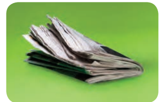
Newspapers and flyers

These are types of recyclable materials accepted in your recycling program: