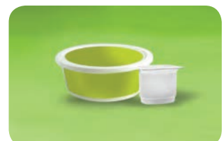
#4, #5 and #7 plastic containers