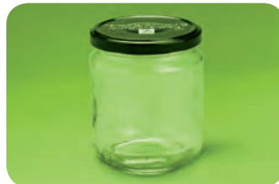
Glass food and beverage containers