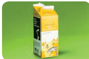
Gable top containers