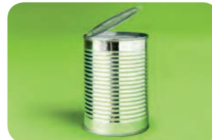
Steel food and beverage containers