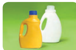
HDPE #2 plastic containers