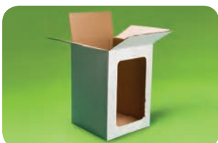
Residential corrugated cardboard