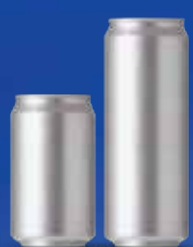
Aluminum food and beverage containers