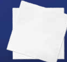
Paper towels, tissues or napkins