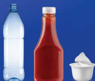
Plastic 1-5 and 7 food and beverage containers