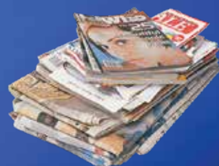
Paper, newspaper and flyers