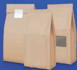
Brown paper bags