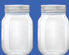
Glass food and beverage containers