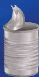
Steel food and beverage containers