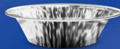
Aluminum foil or foil food containers